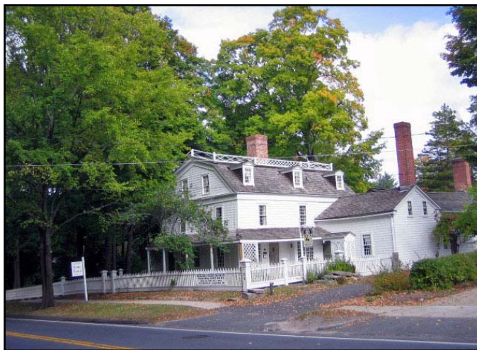
Cannonball House, Cass Gilbert's country house in Ridgefield, Connecticut

Admission is free to Society members. There is a $5.00 charge for nonmembers. Refreshments will be served after the presentation.