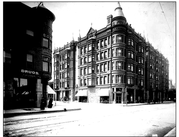
Albion Hotel (top right)