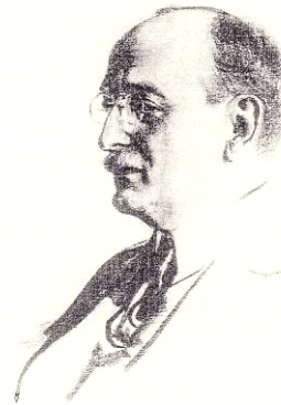
Cass Gilbert 1859-1934 150th Birthday Celebration