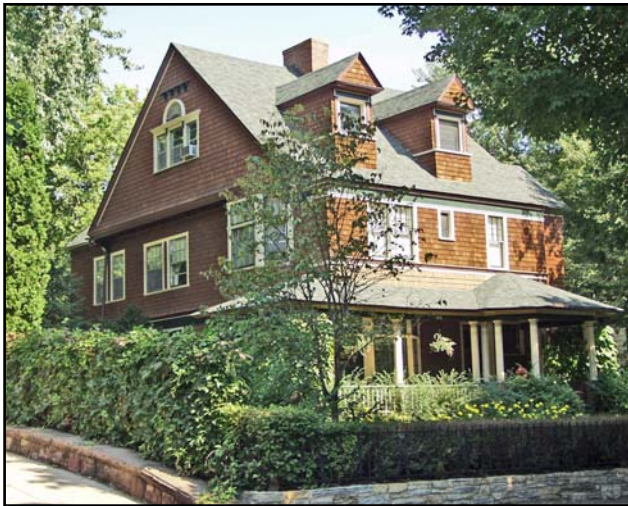
Elizabeth Gilbert House (top left)

In 1890, Gilbert built his "modest" house at 1 Heather Place, then called Floral Street. Gilbert's Shingle-style design has been greatly altered. A tuck-under garage has been added, the shingles have been removed and replaced with stucco and half timbering, and some windows have been replaced. Others are the original leaded glass. The brownstone-faced first story, unusual in St. Paul, looks to East Coast precedents. Gilbert and his family lived on Heather Place until they moved to New York City in 1900 after Gilbert gained the commission for the U.S. Custom House.