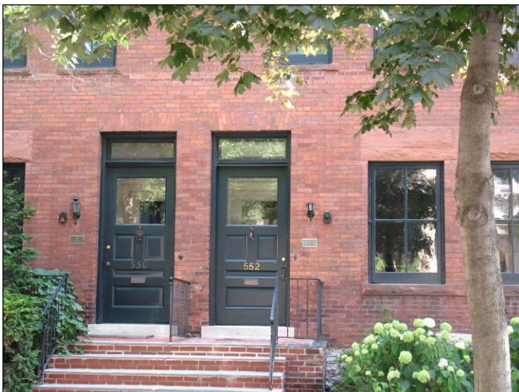
1 Heather Place before remodeling (bottom right)