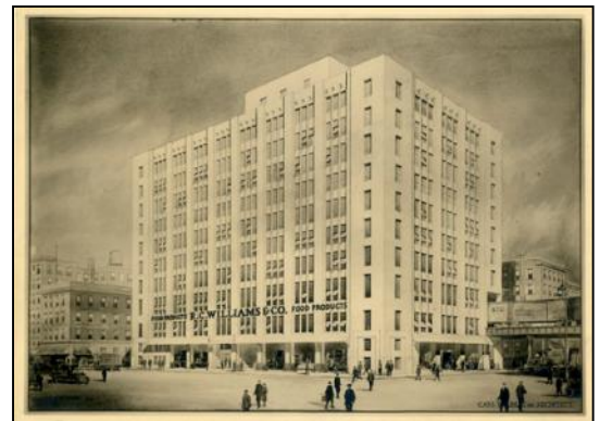
Historic view of R.C. Williams Company Warehouse.