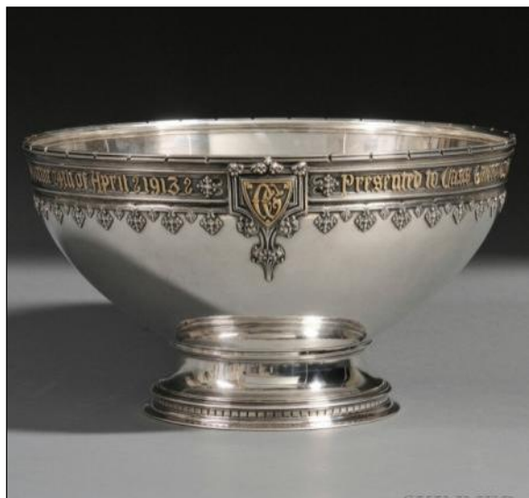
On March 3, 2013, the Skinner auction house, based in Boston, is offering the commemorative Woolworth Building bowl fabricated by Tiffany and Company and given to Cass Gilbert on April 24, 1913.