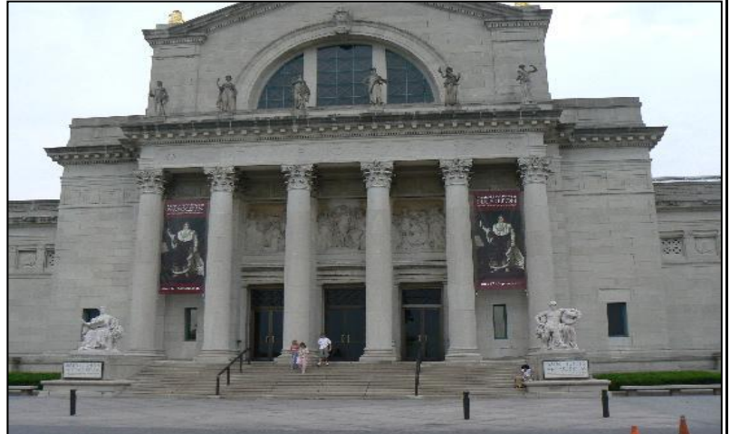
St. Louis Museum of Art, main entrance from Forest Park