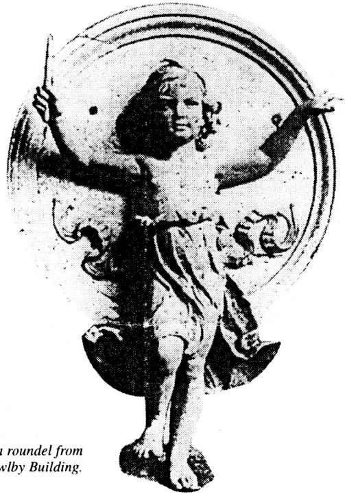
Terra-cotta roundel from the Bowlby Building.

Cass Gilbert Society lectures are open to members and non-members. There is no admission fee for members. There is a nominal fee for non-members. Those who join the society on the night of the lecture will not be charged a lecture admission fee. Membership in the Cass Gilbert Society, registered as a non-profit organization, is $25 per family, and is tax deductible.