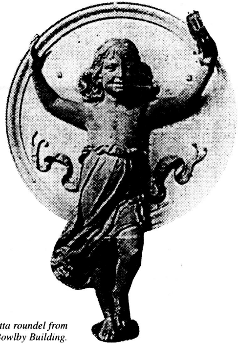
Terra-cotta roundel from the Bowlby Building.