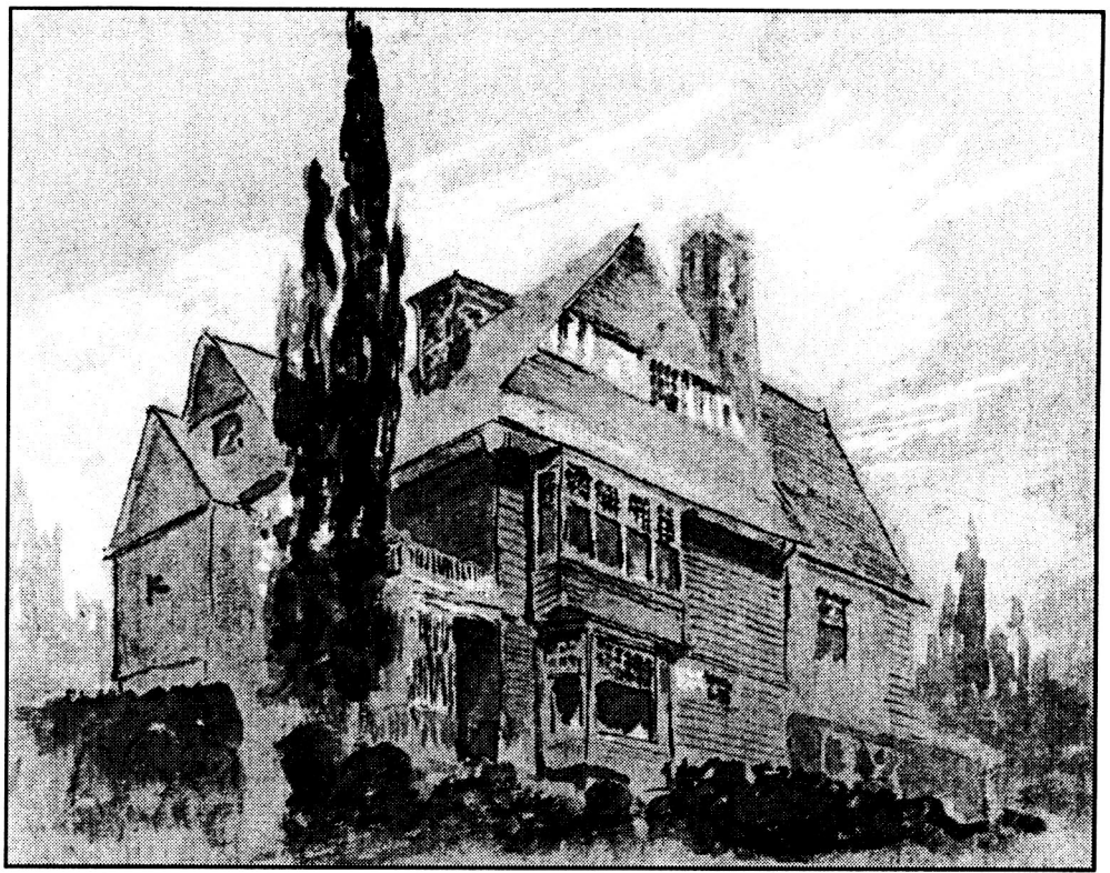
130 Virginia Street designed by Cass Gilbert in 1883.