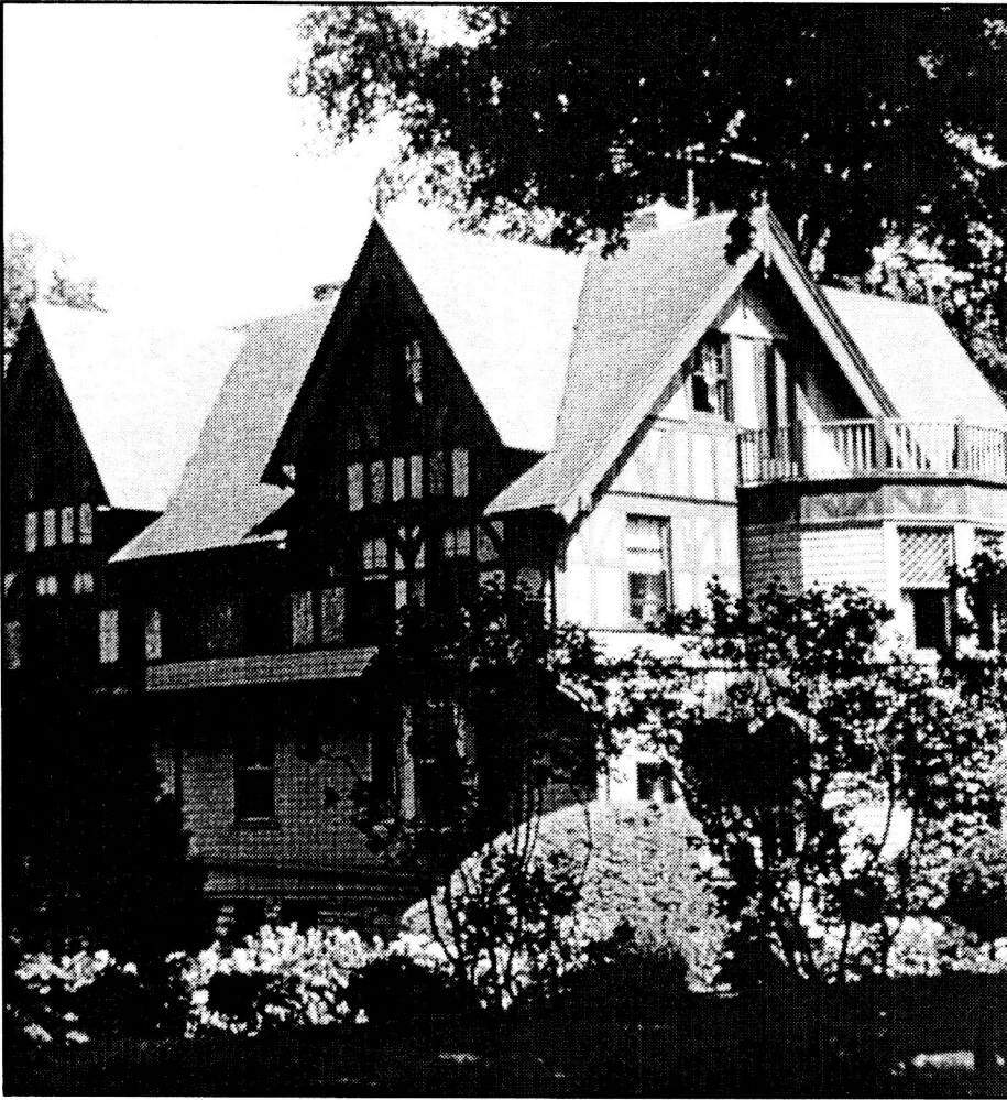
THE C.W. BUNN COTTAGE, 2250 MANITOU ISLAND, DESIGNED BY CASS GILBERT IN 1895 AND RAZED IN 1978.

- Singularity is Almost Invariably a Clue continued from page 3 -