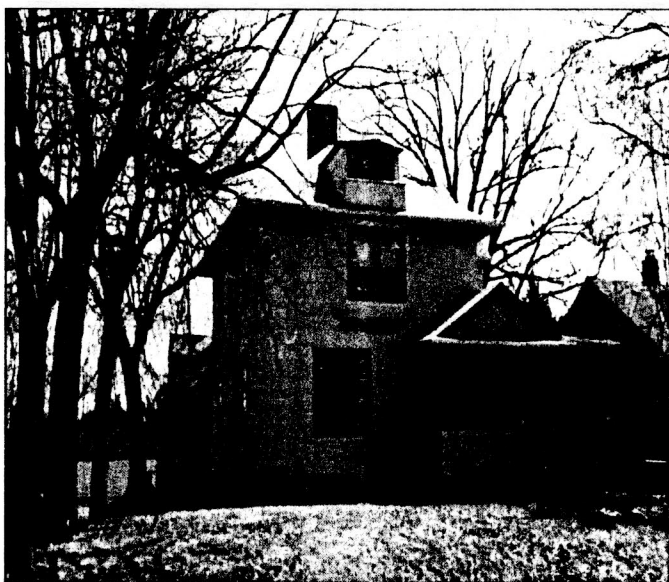
Watson House, current

their house and barn had been built in 1886 according to a plan, one coming out of the office of Saint Paul's most illustrious architect, Cass Gilbert.