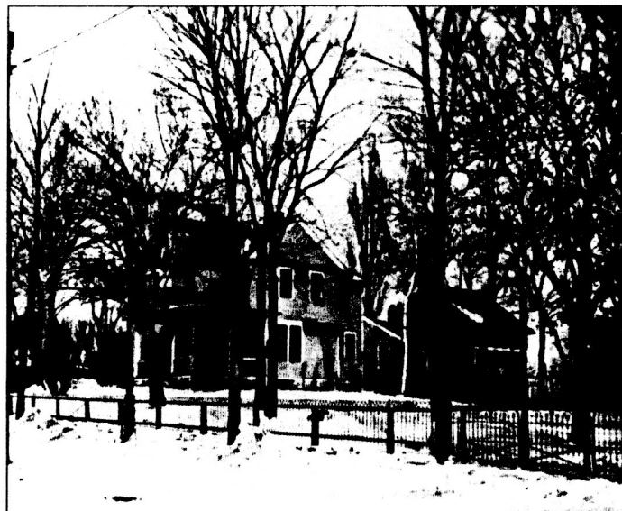
Watson House, circa 1910