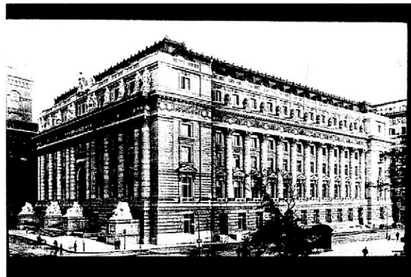
U.S. Custom House in New York from American Landscape and Architectural Design Collection, Library of Congress