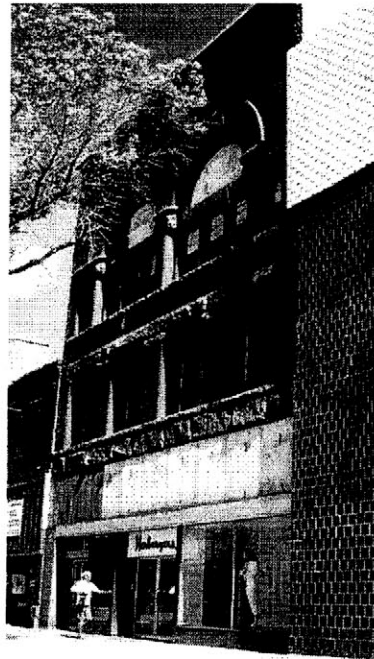
Masonic Temple after removal of screen

Over the years, the Kerr Block has served a number of businesses and organizations. In 1912, the Masonic Temple Association purchased the building and Masonic meetings have been held there since.