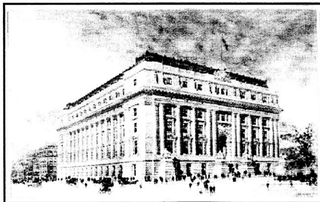
Historic view of U.S. Custom House, New York