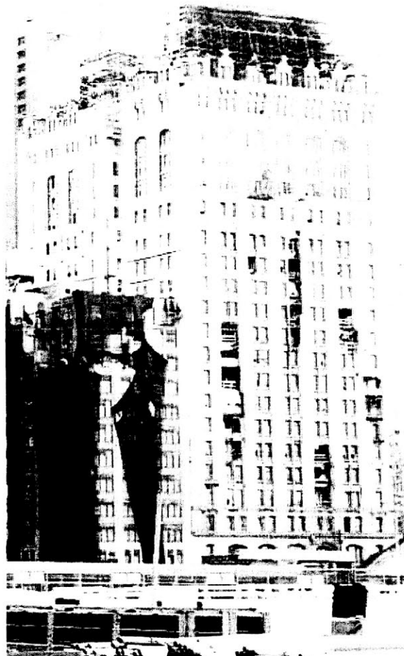
West Street Building, 90 West Street, New York, as it appeared in mid-March.

As visitors to Lower Manhattan know, the destruction of the World Trade Center restored the visibility of the Woolworth Building to the skyline. Both it and Gilbert's New York County Lawyers' Association Building are within easy walking distance of the World Trade Center site.