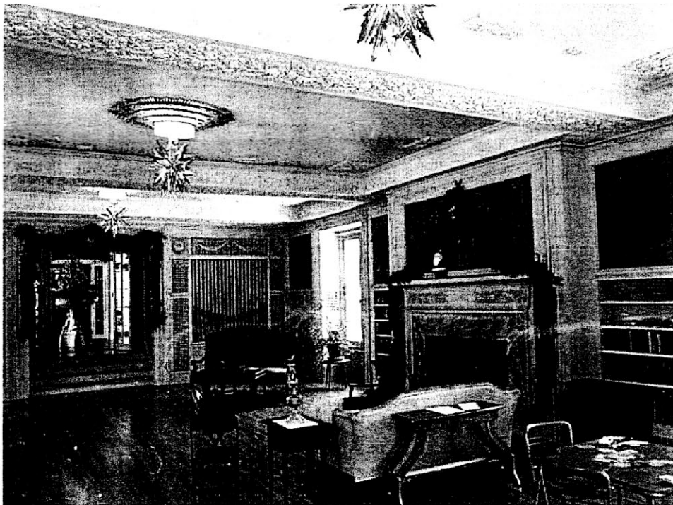
The interior of Cedarhurst in 1976.

We will be served a nine-course tea and tour the first floor of the house and the grounds. The cost, which includes tax and gratuities, is $26.00 for members and $30.00 for nonmembers. Pre-registration is encouraged, using the enclosed response form.