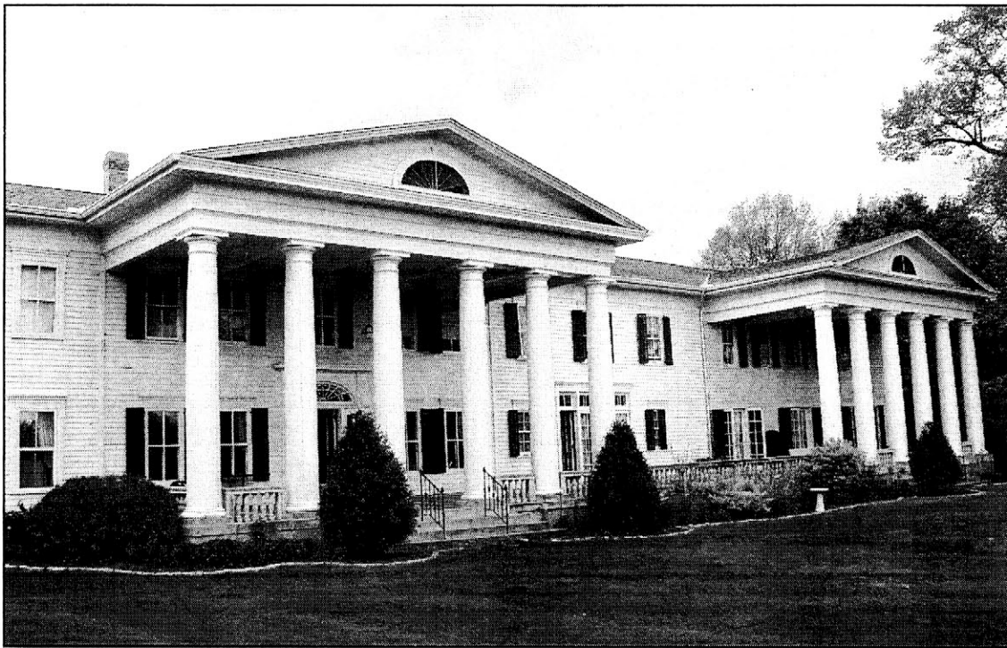
Front of Cedarhurst

Plans are well underway for a wide-ranging celebration of the centennial of the Minnesota State Capitol in 2005. Although the Capitol was officially opened in January 1905, the centennial celebration will extend throughout the year. The Cass Gilbert Society will be partnering with the University of Minnesota College of Architecture and Landscape Architecture to organize a symposium and related tours on the architecture, image, and meaning of the Capitol to citizens across the state.