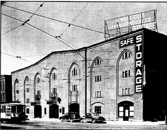
Minneapolis Realty Warehouse in 1948

After a long life as a warehouse, this remarkable design was skillfully converted in 1992 as the home of the Theater de la Jeune Lune.