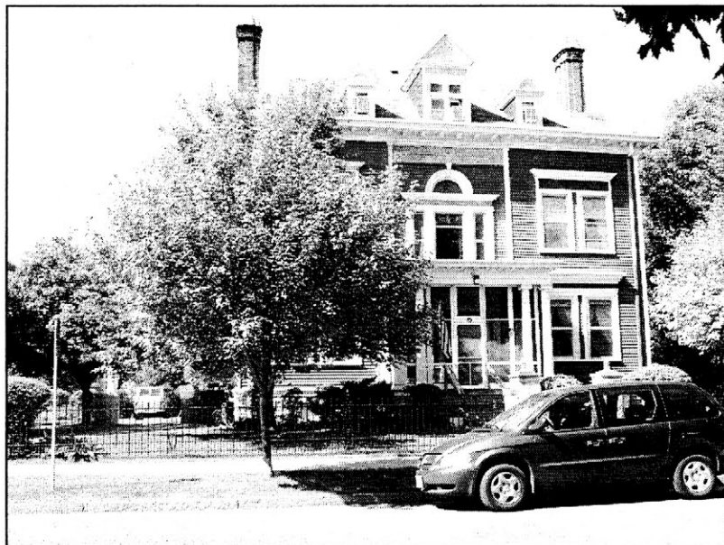
C. P. Noyes House, 89 Virginia Street, Saint Paul, 1889