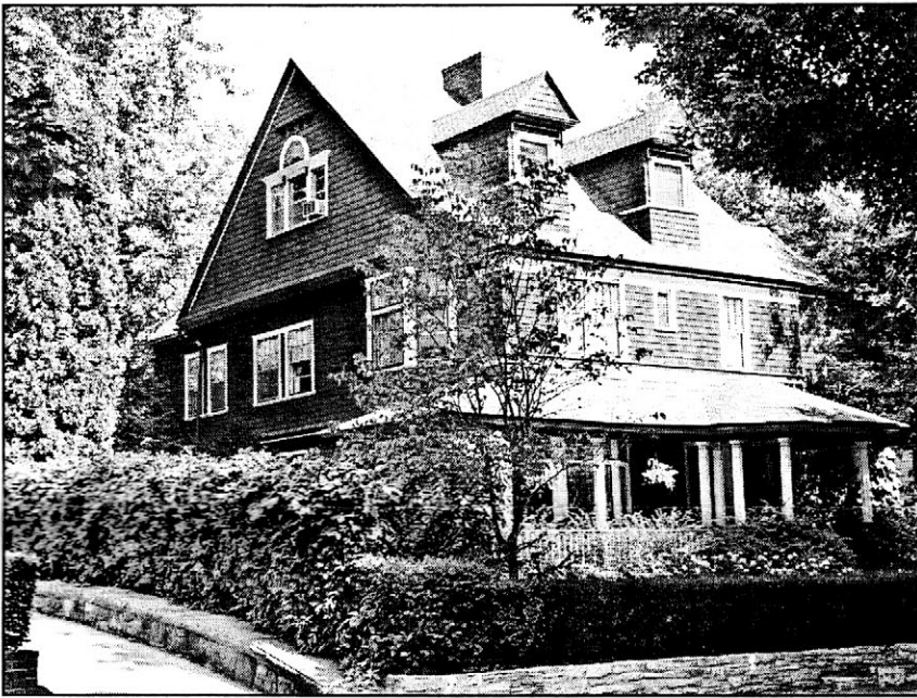
Elizabeth Gilbert House, 471 Ashland Avenue, Saint Paul, 1884