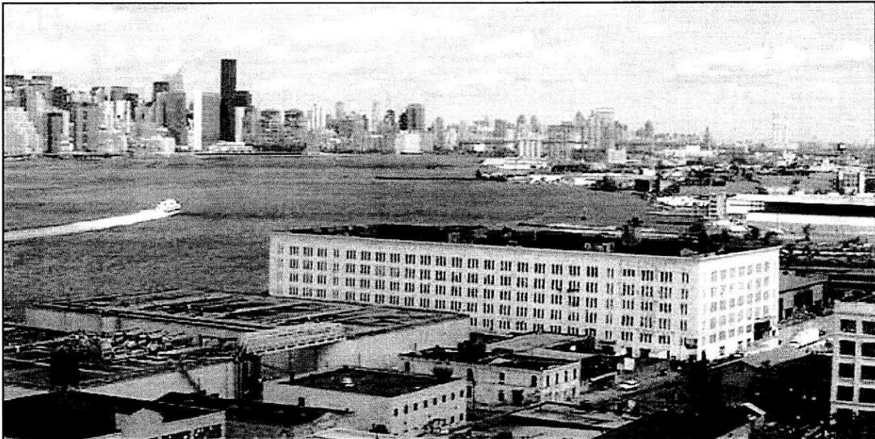
Austin, Nichols and Company Warehouse in Brooklyn