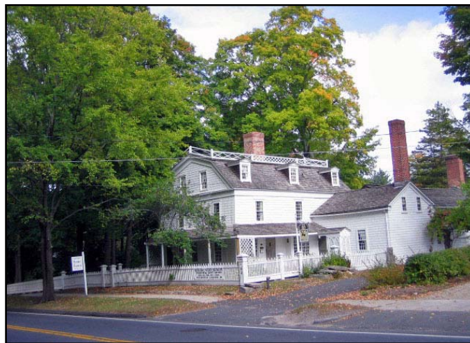
Cannonball House, Cass Gilbert's country house in Ridgefield, Connecticut

Admission is free to Society members. There is a $5.00 charge for nonmembers. Refreshments will be served after the presentation.