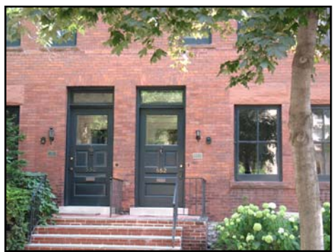
552 Portland Avenue