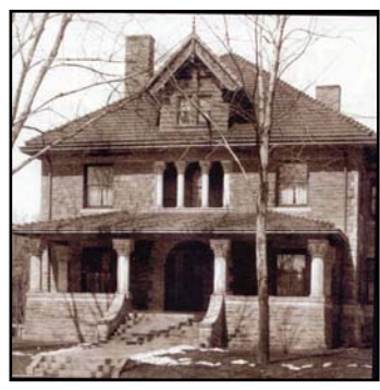
Freeman House at 505 Summit Avenue