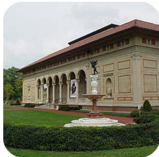
Allen Memorial Art Museum, Oberlin College, architect Cass Gilbert, 1917.

Cass Gilbert Society to visit Oberlin, Ohio, September 19-20, 2009. More detailed information to follow in the next Newsletter .