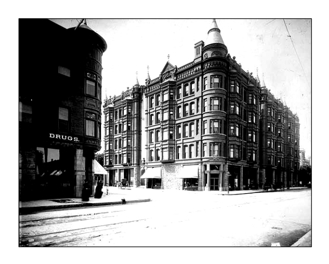
Albion Hotel (top right)

550 Portland Avenue (bottom left)