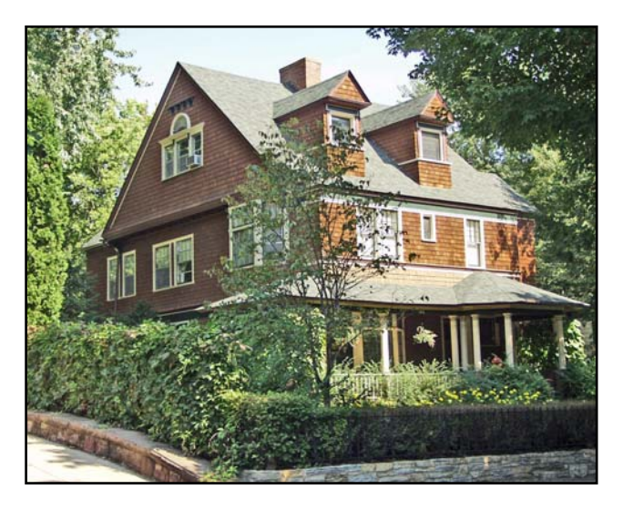
Elizabeth Gilbert House (top left)

In 1890, Gilbert built his "modest" house at 1 Heather Place, then called Floral Street. Gilbert's Shingle-style design has been greatly altered. A tuck-under garage has been added, the shingles have been removed and replaced with stucco and half timbering, and some windows have been replaced. Others are the original leaded glass. The brownstone-faced first story, unusual in St. Paul, looks to East Coast precedents. Gilbert and his family lived on Heather Place until they moved to New York City in 1900 after Gilbert gained the commission for the U.S. Custom House.