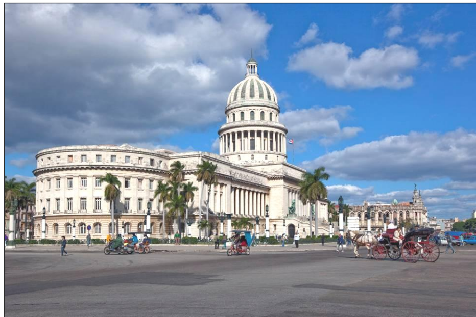
El Capitolio in Havana, Cuba.