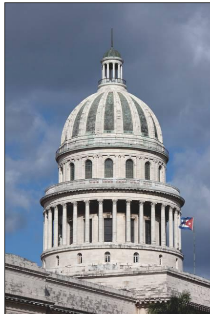
El Capitolio

Admission to the lecture is free for members of the Cass Gilbert Society and the University Club as well as students. There is a $5 charge for non-members. Refreshments will be served following the presentation.