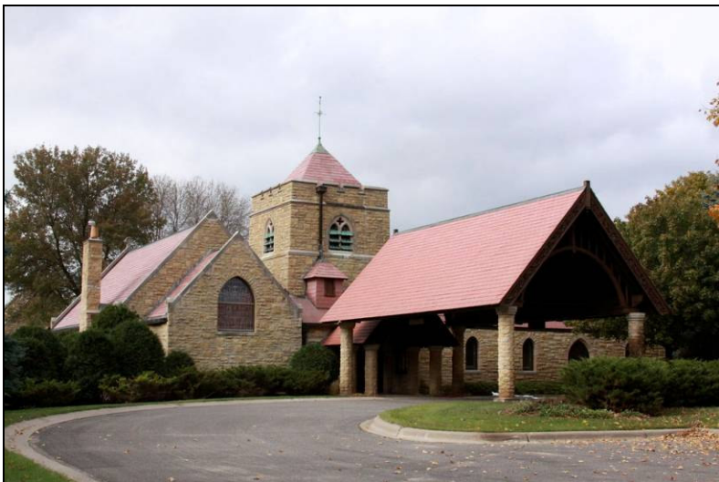
Roselawn Cemetery Chapel.