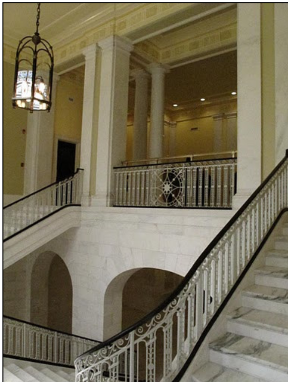
Waterbury Municipal Building Interior Staircase