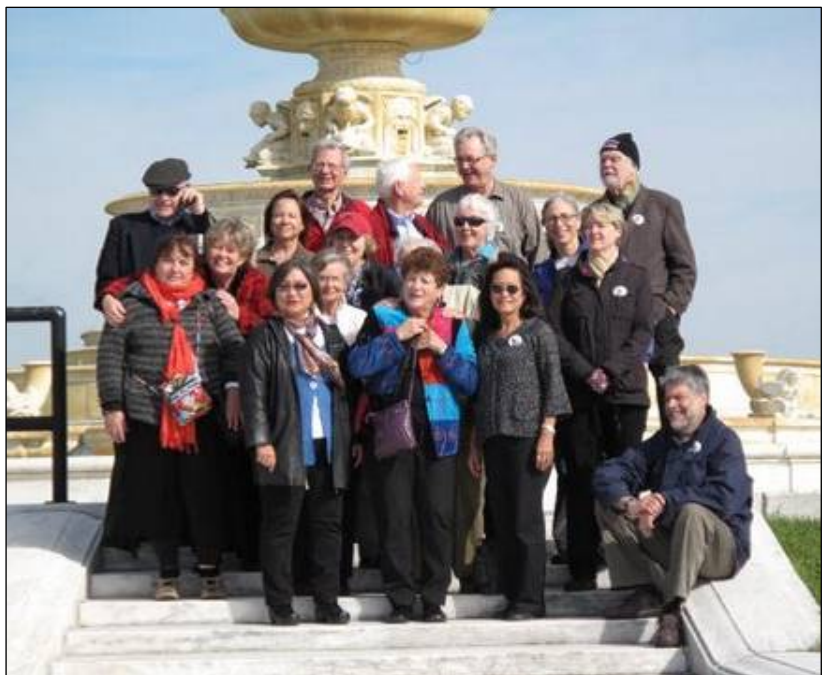
Cass Gilbert Society tour members by the Scott Fountain, Belle Isle Park.

Several of the tour participants will be making a presentation on the tour early next year (date to be determined). We look forward to seeing you there.