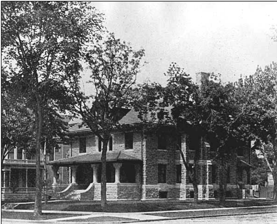
Freeman House in 1902.

Members of the Cass Gilbert Society and others on our mailing list will receive separate invitations to this event with more detailed information.