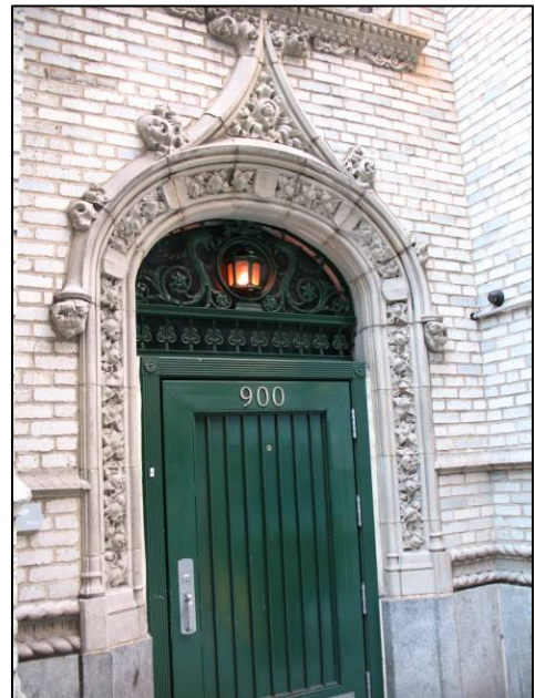
Gothic detail at side entrance to the Rodin Studios, 900 Seventh Avenue.