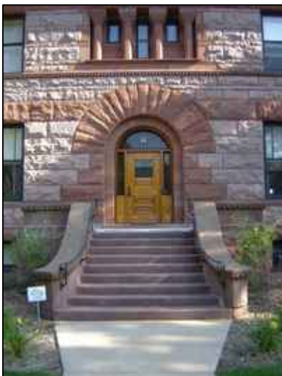
Detail of the entrance of the W.H. Lightner House, 318 Summit Avenue. Built 1893.