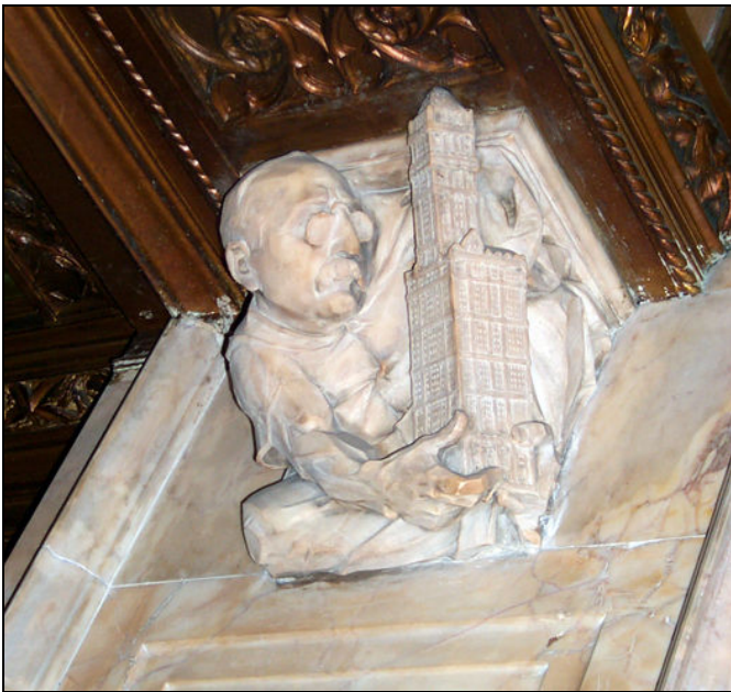
On a ceiling corbel in the lobby, Cass Gilbert holds a model of the Woolworth Building.

The Cass Gilbert Society looks forward to participating in scholarly and celebratory activities that are planned for New York next year in conjunction with the 100th anniversary.