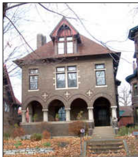
Crawford Livingston House, 339 Summit Avenue. Built 1898.