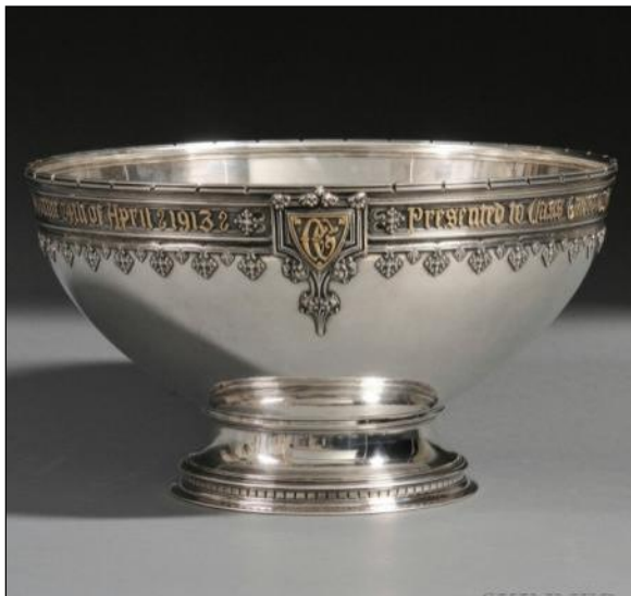
On March 3, 2013, the Skinner auction house, based in Boston, is offering the commemorative Woolworth Building bowl fabricated by Tiffany and Company and given to Cass Gilbert on April 24, 1913.