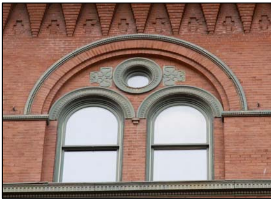
Window detail of the Gilbert Building (originally the Blood Warehouse), 1893-1894, 413 Wacouta Street, St. Paul.

Meet at Union Depot , 214 East 4 th Street at Sibley, starting at 2 p.m. and lasting about two hours. Cost: $15 per person, cash or check, payable at the beginning of the tour. The tour will proceed rain or shine, with a skyway backup in case of a downpour.