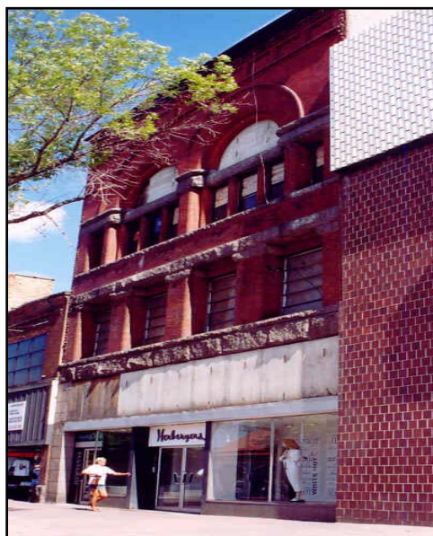
Kerr Block in 2003

November 10-12 Cass Gilbert Society tour to Austin, Texas (see inside)