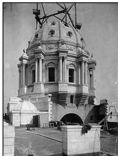
Capitol dome under construction, 1901

Participants in the Cass Gilbert Society tour to Austin, Texas, will be making a presentation in April, date to be announced.