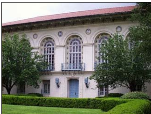
Battle Hall, University of Texas Designed by Cass Gilbert, 1911 University of Texas

For a complete listing of board members see the back cover.